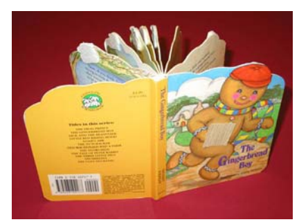
An example of a book that has been adapted using packaging peanuts as page fluffers.

Paper clips with beads threaded and glued on them also make great removable page fluffers.